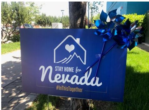
Boys and Girls Club of Truckee Meadows

childhood for all. Some families joined the class meeting with their kindergartener. A few teachers posted on social with #GOBLUENV.