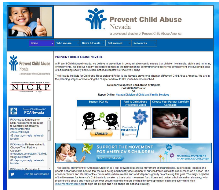
Image of Prevent Child Abuse Nevada Home page.

PCANV created a webpage specifically for information regarding the campaign which was available beginning in February 2012. On the home page, preventchildabusenevada.org, there is a direct link to the Choose Your Partner Carefully Campaign as shown in the image below.