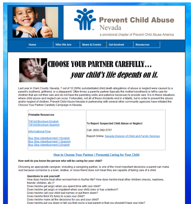
Image of Choose Your Partner Carefully page.

The webpage for the campaign included links to all the documents produced by the campaign (bus stop advertisements and brochures), information about reporting child abuse, and information about how to choose your partner carefully. A snap shot of the page is provided below.