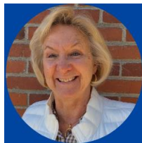
Sherry Waugh Child and Family Research Center UNR - Reno