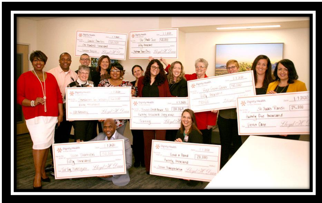
PCANV receiving Dignity Health Community Grant.